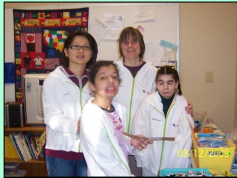
Everyone learns and everyone benefits.