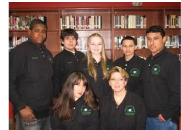
Members of the Cleary Academic Bowl Team meet regularly with their coaches to develop strategies, gain skill and practice for competition at Mill Neck.

Jeopardy. It consists of three rounds of questions based on these curriculum areas: Current Events; Arts; Deaf