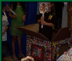
A summer class performs "Gingerbread Baby".